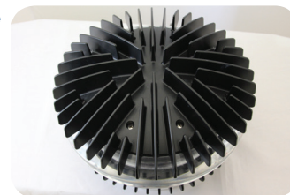
Precision upper heat sink

The SL-300-2D5-1 lantern is available with a class-leading integrated, low-powered Type 1 or Type 3 AIS. When fitted, the AIS is encapsulated within the body of the SL-300-2D5-1 to maintain the weatherproof integrity.