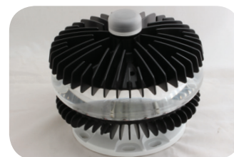
Shown with optional GPS antenna