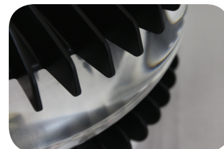
Sealite's revolutionary long range lens