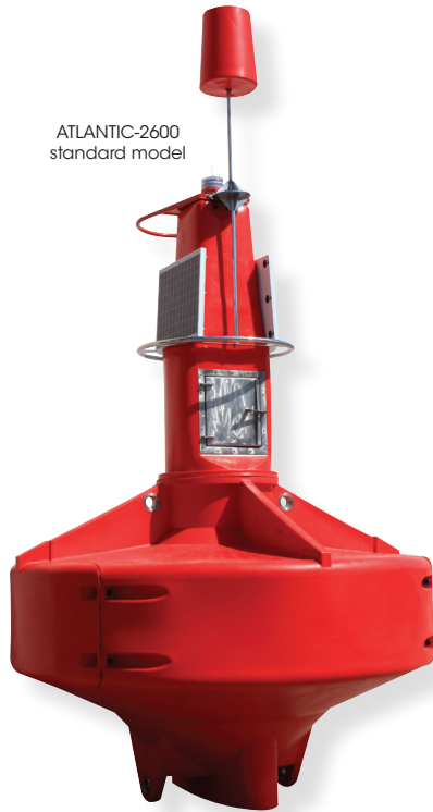
ATLANTIC-2600 standard model