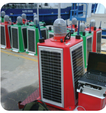
Sealite's AIS AtoNs can be delivered pre-programmed or can be provided with software enabling the user to program the unit

In addition, the AIS enabled AtoN broadcasts AIS Message 6 received by the designated base station, allowing the operator to monitor the AtoN for solar and battery voltage, flash code setting and light status. Meteorological and hydrological data and a host of other parameters can be