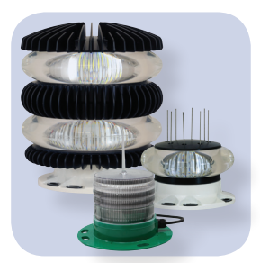
Stand alone lanterns