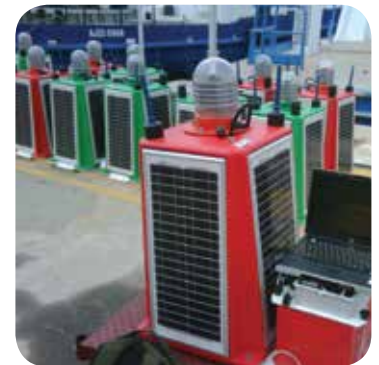
Sealite's AIS AtoNs can be delivered pre-programmed or can be provided with software enabling the user to program the unit

The Type 3 AIS AtoN can also support remote control functions including lantern flash character, ON/OFF activation and intensity setting.