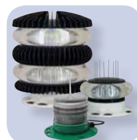
Stand alone lanterns