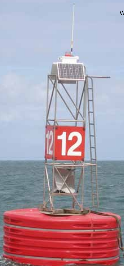
Trident buoy Westernport Bay, Australia

By choosing Sealite you can rest assured you have chosen the very best.